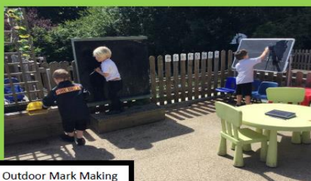
Outdoor Mark Making