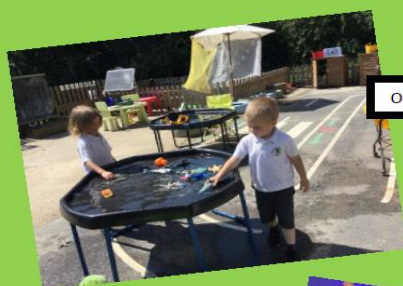
Outdoor Water Play