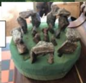
Albert's amazing Stonehenge model!