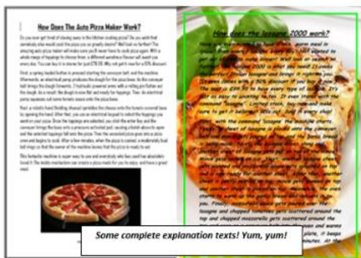
Some complete explanation texts! Yum, yum!