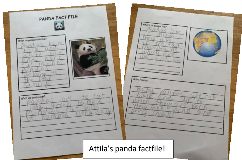
Attila's panda factfile!