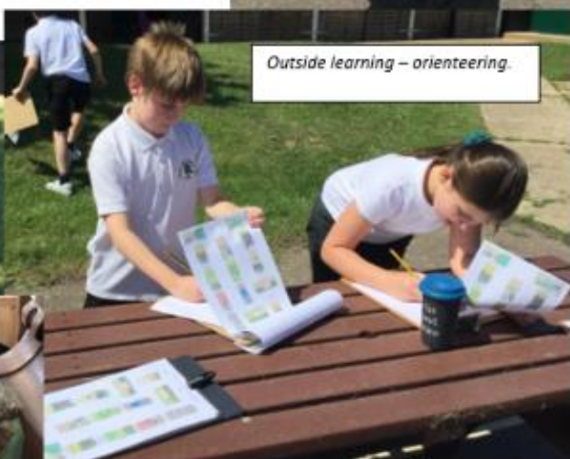
Outside learning – orienteering.