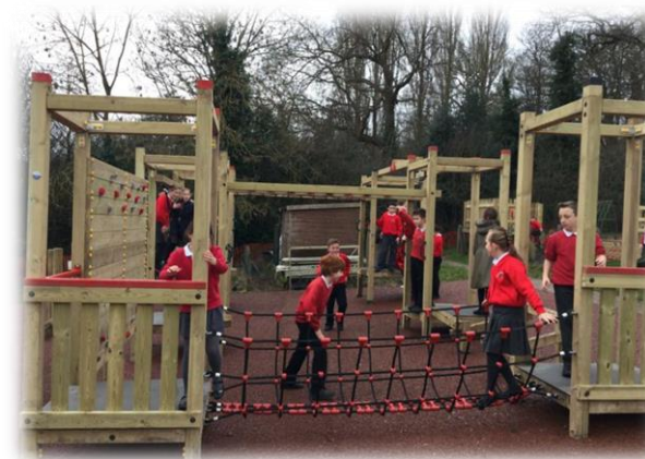
Enjoying the apparatus!

For health and safety reasons, long hair should be tied back and jewellery (other than small stud earrings for pierced ears) should not be worn.