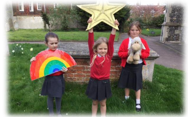
Easter Experience at Church

We also see ourselves as an important part of the local community. In addition to our excellent relationship with St Mary the Virgin church, we work with the community in a number of different ways, including hosting Happy Apple Stay and Play toddler group each Thursday morning at school.