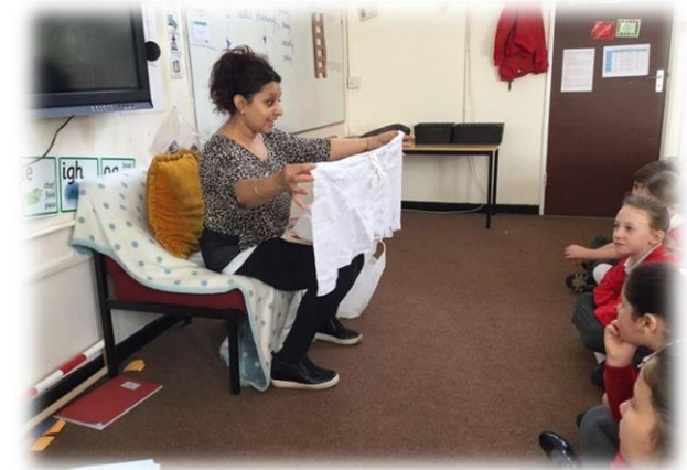
Warrenwood's Sikh Day

We are more than happy to answer any questions you may have. For further information, please either visit our website www.essendon.herts.sch.uk or contact the school office on 01707 261 209.