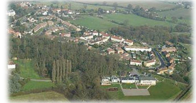
Aerial view of the school