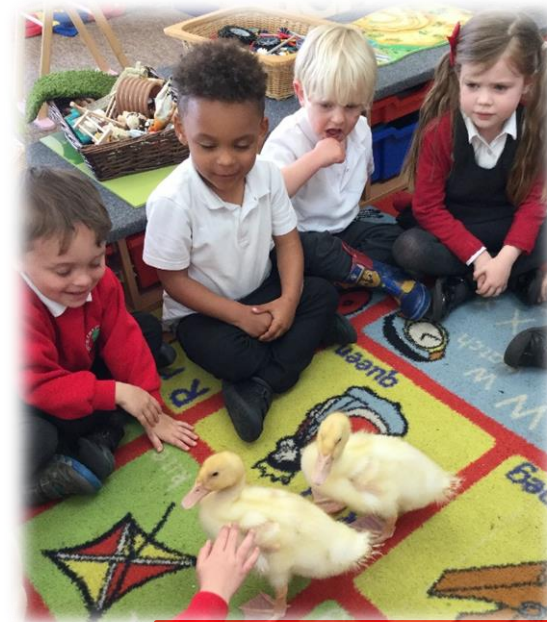
Ducks' visit to Early Years