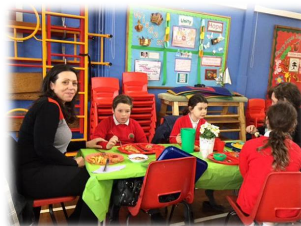
Mothers Day School Lunch