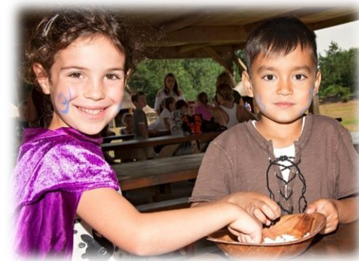
Enrichment week trip to Celtic Harmony Camp

Our staff are all trained to safeguard pupils and prevent them from harm. We work closely with families and external agencies to ensure that early intervention leads to better outcomes for our pupils.