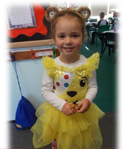
Supporting Children in Need