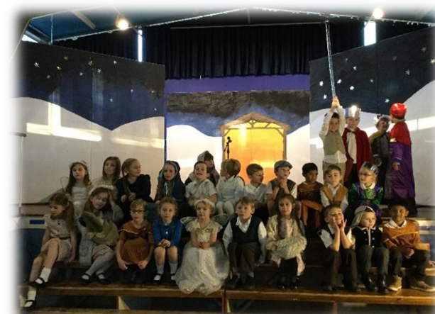
Traditional Nativity: part of our 70 th birthday celebrations