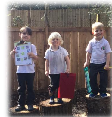
Nursery enjoying the Outdoor Classroom

During their time in Harefield class, pupils begin to prepare for their transition to secondary school and are given increasing amounts of responsibility, such as becoming a school captain, sports leader, or leading our acts of worship.